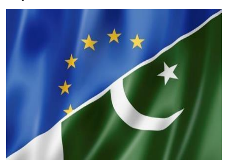
Figure 1. EU-Pakistan Friendship Flag.

European Union being a huge proponent of human rights has never backed down from providingaid and assistance for humanitarian causes. Since 2009, the EU has been providing Pakistan withthe amount of €537 million as humanitarian assistance, as well as an allotment of €21.5 million for the year 2016. Assistance has also been given to the victims of flood. EU has continued to sustain people affected by conflict as well as those afflicted from undernourishment and lack of food security.the EU has also been generous enough to aidthe Afghan refugees residing in Pakistan.