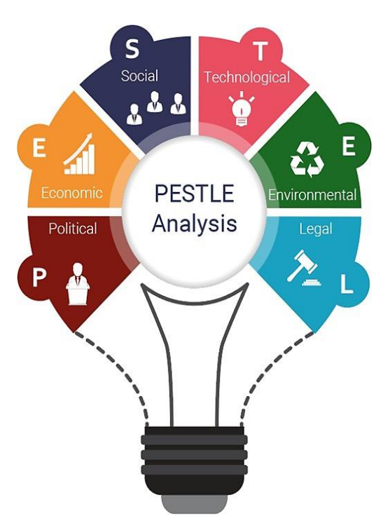
Figure 4. Infographic demonstrating the various factor dealt by the PESTLE analysis.