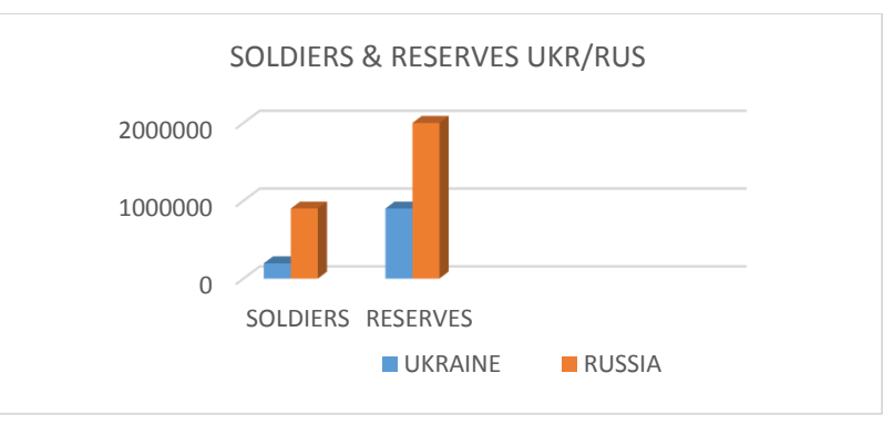
Figure 1. Soldiers & reserves – Ukraine and Russian Army Forces.