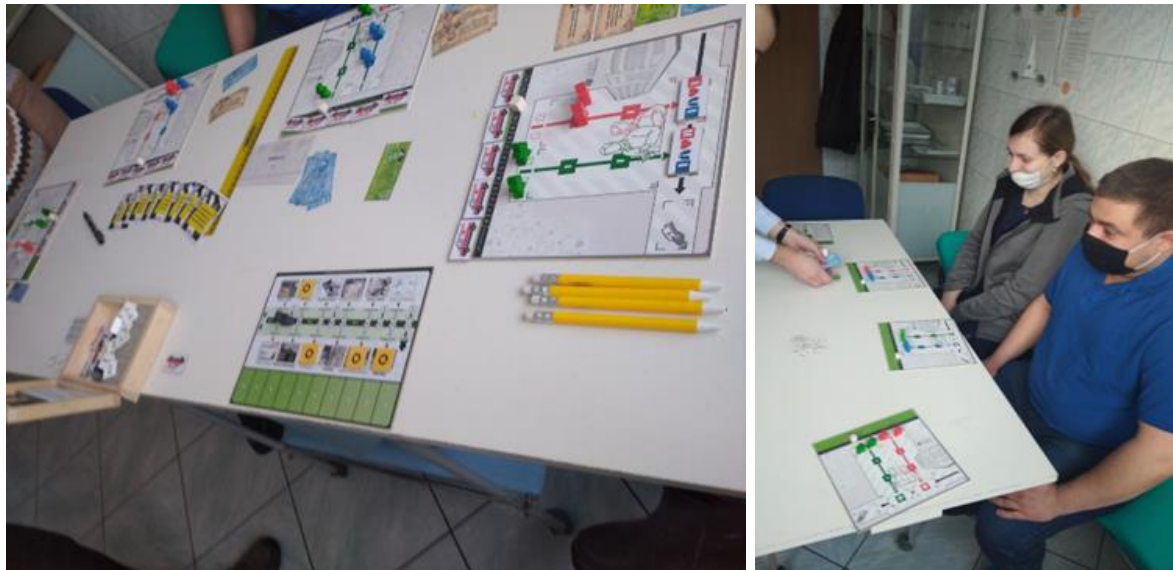
Figure 4. Koromo Health game prepared for practical training and two of the game participants during the training.