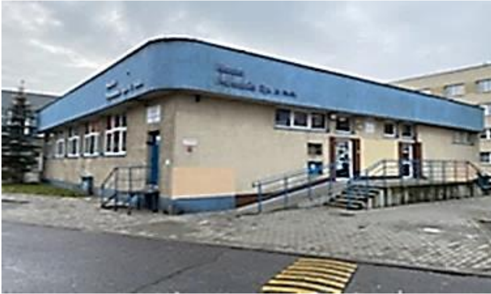
Figure 1. Non-public health care facility Nasza Poradnia Sp. z o.o.