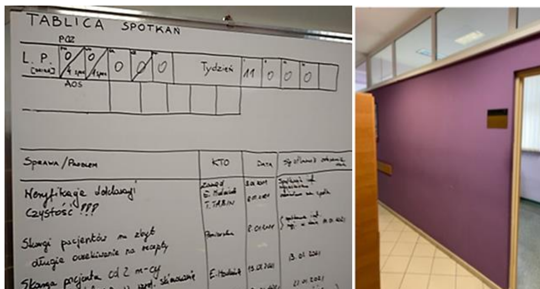
Figure 2. The meeting board and the place where it was placed - the main corridor next to the registration desk.

financial outlay, using already existing organizational solutions. It was proposed to implement visual management - a meeting board (Fig. 2) and change periodic organizational meetings to regular, weekly - organizational meetings of several minutes in the presence of everyone starting the shift, twice a week.