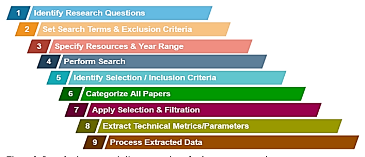
Figure 2. Steps for the systematic literature reviews for the management sciences.

The suggested research illustrates how the systematic review method, when used as a rigorous tool, may be used to incorporate multiple the literature pertaining to the phenomenon of university-industry collaboration. Technology's importance in promoting economic growth and enhancing enterprises' competitiveness in a global market has become increasingly clear in recent years. Through one of the three primary channels in-house, independently generated technology, ready-made technology obtained through acquisition, or cross collaboration businesses have been consistently pushed to increase their knowledge bases and capacities.