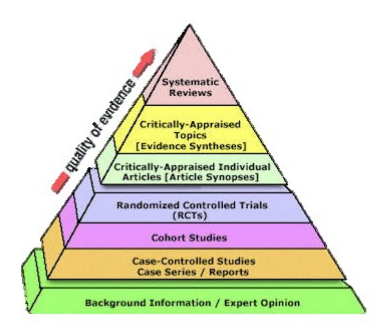
Figure 1. Schematic Diagram For Systematic Literature review.

Systematic review, as stated by Tranfield, Deyer, and Smart generates credible information from a pool of knowledge spread over several research. By doing a systematic review, a researcher is better equipped to chart and assess the existing intellectual landscape. Scholarly study into a certain research topic requires adherence to a strict work framework to make the information discovered more dependable and committed to the research topic.