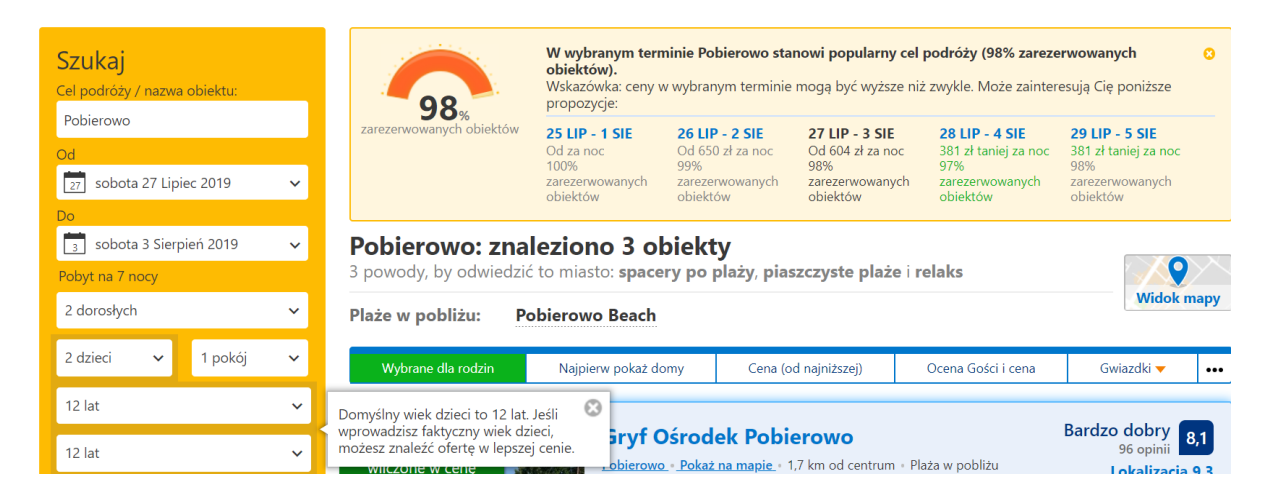
Figure 1. Sample data obtained from booking.com for the town of Pobierowo on July 23, 2019.

Figure 1 shows sample data obtained from Booking.com. This data refers to the town of Pobierowo, where 98% of accommodation, meeting the above criteria, was booked on the Booking.com website on July 23. At that time, only three sites met the selection criteria.