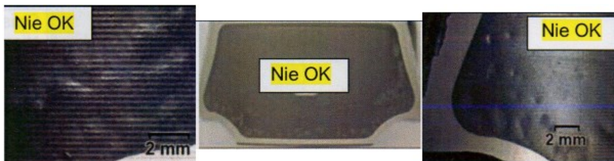
Figure 2. Graphite layer thickness too high.

Visual quality control is carried out in the company after the graphitization process. This control is carried out in accordance with the company's internal procedure according to each production order. Example results of discrepancies, which obtained the highest score in the FMEA analysis of the graphite process, are presented in Figures 2 and 3.