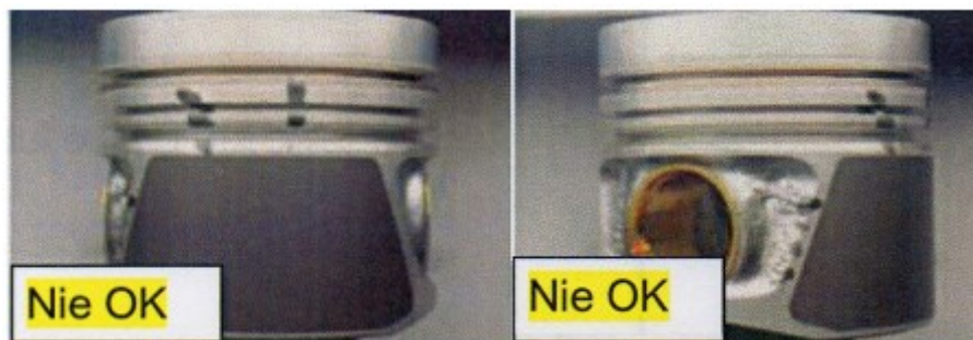
Figure 3. Graphite stains on the piston surface.

The visual inspection results shown in Figure 2 illustrate the result of a very thick coating (> 20), which may cause the so-called orange peel effect and the surface covered with craters.